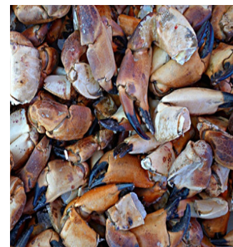
Above: A great haul of stone crab claws.

anticipated events later this spring, the Marathon Seafood Festival. This year's festival runs from March 12th - 13th.