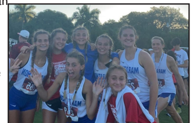
above: girls team with district medals

fast course. This will be our first morning race all season and we are looking forward to seeing if all of