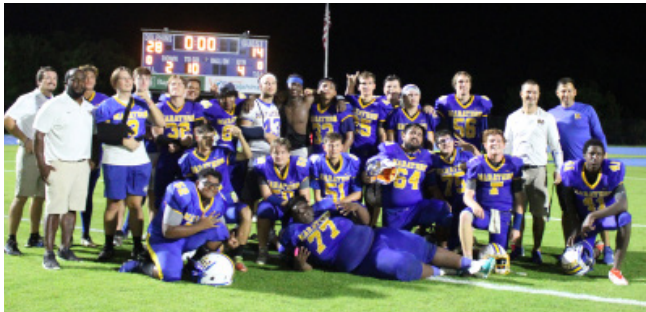
Dolphins Football Team after their big 28-14 Win over Everglades Prep